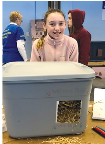
A big thanks to our youth volunteers who spent their weekend making warm cat shelters.

Earlier this year, animals in need brought compassionate youth and their families together to build warm, sturdy shelters for outdoor community cats. With your support, we were able to purchase enough supplies to create more than 100 insulated cat houses, and with the help of 90 volunteers of all ages, we were able to provide these warm shelters to numerous community cat colonies throughout the City of Newark.