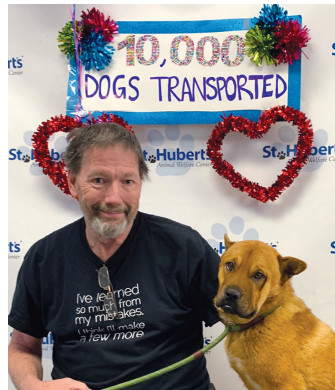
Carson going home with his new dad.

Our Sister Shelter WayStation Program has reached an exciting milestone... 10,000+ dogs have been transported from areas of need to areas of opportunity since the program's inception in 2016. Lucky for Carson, he was number 10,000! This lifesaving network consists of 84 shelter partners, with St. Hubert's working as the hub. For every dog adopted, the destination shelter sends back funds to the source shelter for community spay/neuter, targeting the root cause of pet overpopulation.